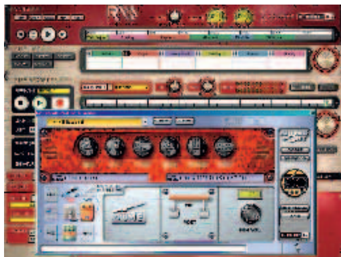
Embedded GuitarPort software gives you access to all your favourite tones