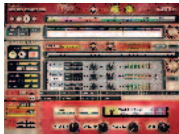
Create a stack of loops and build a riff that can be dragged into the song window