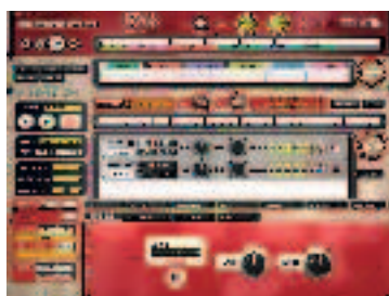
The metronome controls allow simple time-keeping and bpm changes