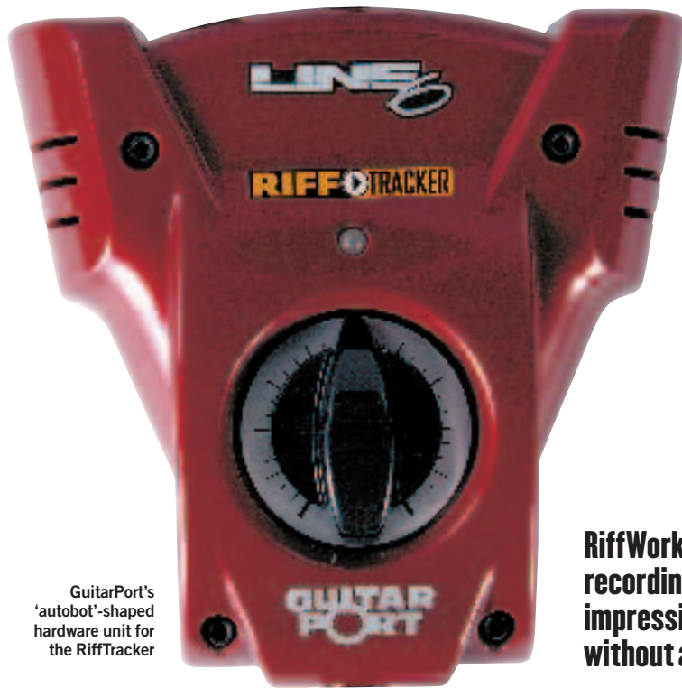
GuitarPort's 'autobot'-shaped hardware unit for the RiffTracker

with the riffs and musical ideas that you create for yourself.