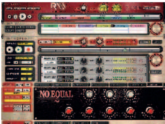
Manipulate EQ with effects module No Equal