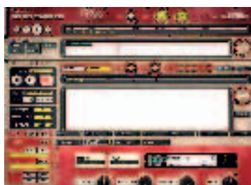
RiffTracker's quad-knobbed Instant Drummer

If you're about to make the leap into hard-disk recording but are discouraged by technical jargon and the complexity of sequencing software, then this product might just be the easiest and fastest route to making CDs of your own music. Installing