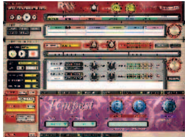
Another effects block, a phaser called The Tempest, lets you rock up a storm...

RiffWorks is a powerful and capable recording package that gives impressive-sounding results fast without any mouse-clicking gymnastics